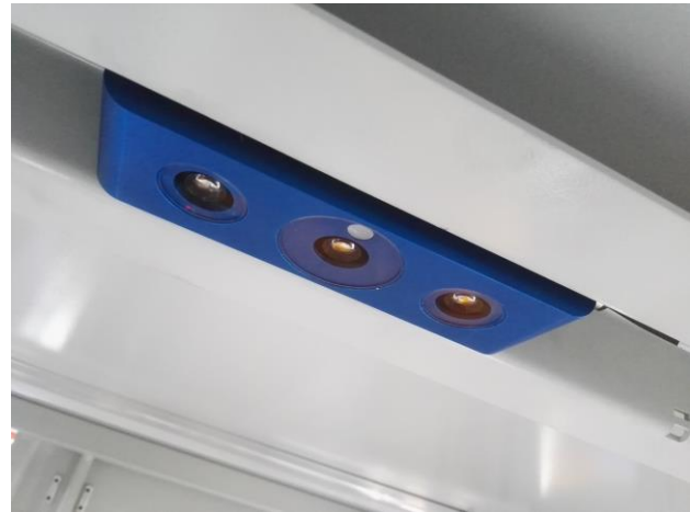
Ensenso N35 placed approx. 1 m above the container

Ensenso N35 models are therefore particularly suitable for the 3D acquisition of still objects and for working distances of up to 3,000 mm.