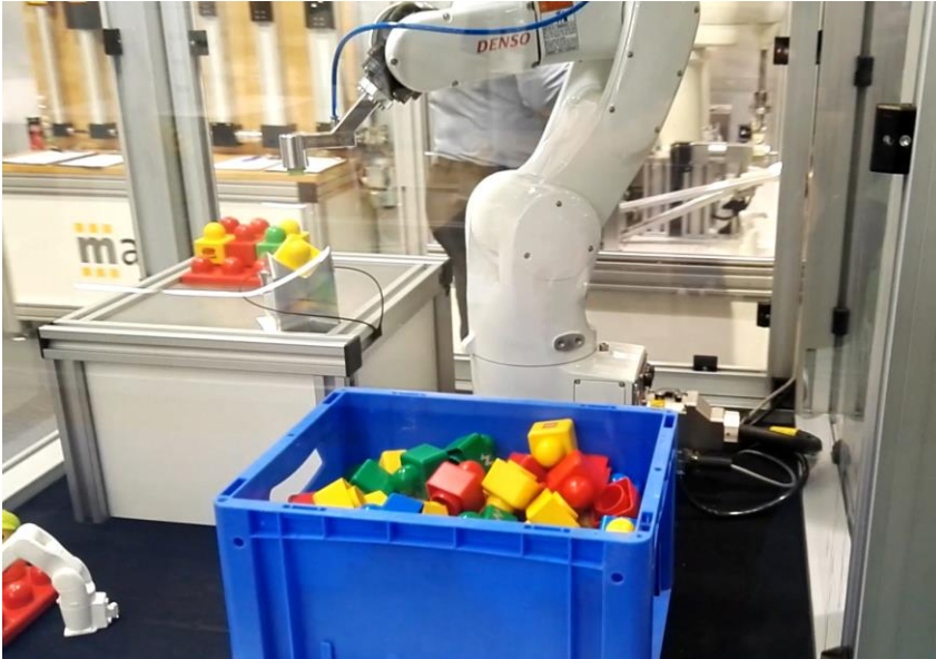
Perfectly balanced: Robot from Denso, powerful industrial PC, Ensenso N35 stereo 3D camera, powerful software

It saves the user from having to program his own interfaces and facilitates communication between image processing and robot.